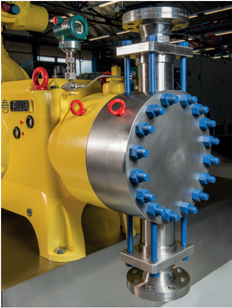
The 20K PSIG Primeroyal X delivers greater flow and higher pressure ranges.

Milton Roy's new Primeroyal X pump extends capabilities in even the most challenging environments at 20K PSIG.