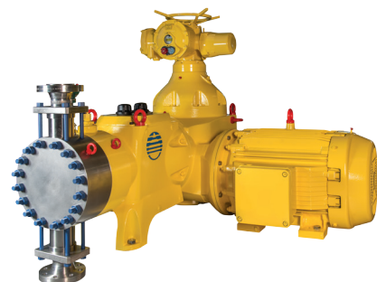
The Primeroyal X with metallic liquid end and PTFE (Teflon®) double diaphragm, horizontal motor configuration, and actuator with integrated electronics.