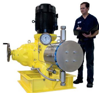
The Primeroyal X with metallic liquid end and metallic double diaphragm, vertical motor configuration, and manual stroke adjustment.

If you need a single source solution for all your pump requirements, it's Milton Roy.